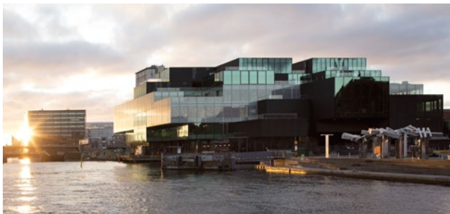
BLOX, Copenhagen, Denmark, 350 spaces, public