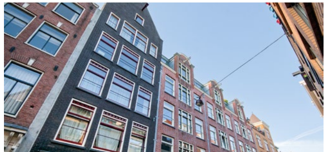
Herengracht, Amsterdam, Netherlands, 44 spaces, mixed-use