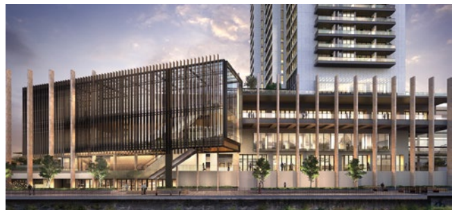
The Lennox, Sydney, Australia, 374 spaces, residential