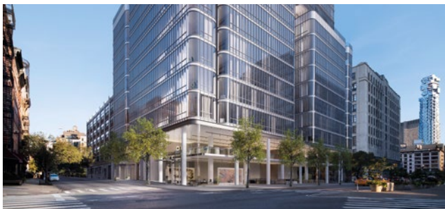
SoHo Tower, New York, USA, 42 spaces, residential